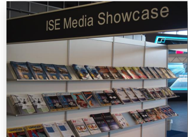
invidis Digital Signage Yearbook at the ISE Media Showcase 2014