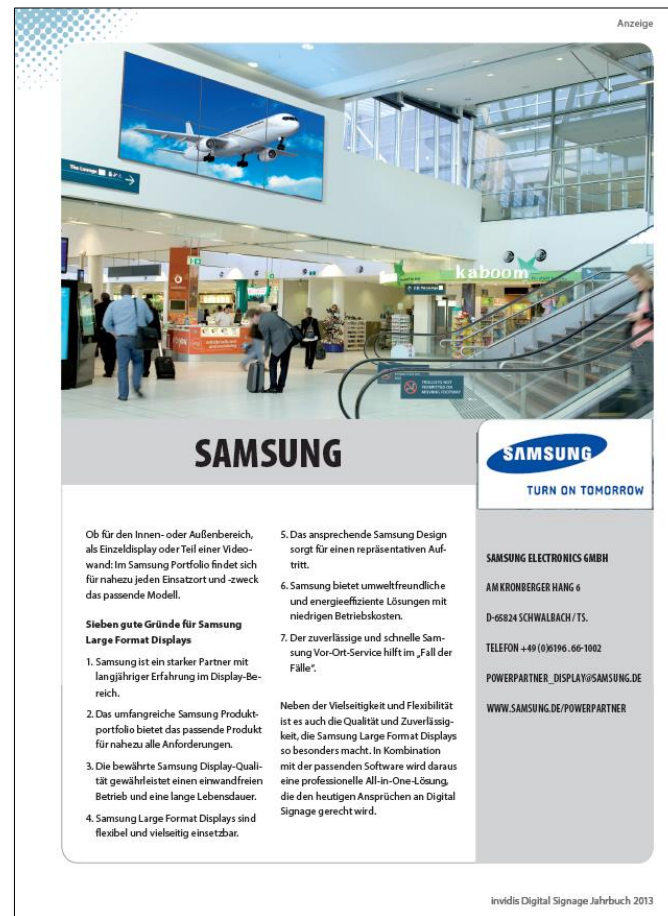
Example Company Profile