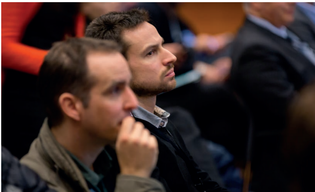
The Official ISE 2015 Event Technology Route Planner

Simply study the hall plans on the following pages of the Event Technology Route Planner and make a note of the highlighted stands. The accompanying listing will show which companies are occupying each location. Also shown is a selection of the Professional Development sessions connected to this topic so that attendees can plan their visit around them if required.